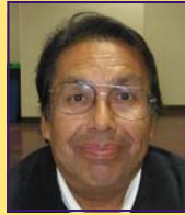
Alternate: Sergio Garcia