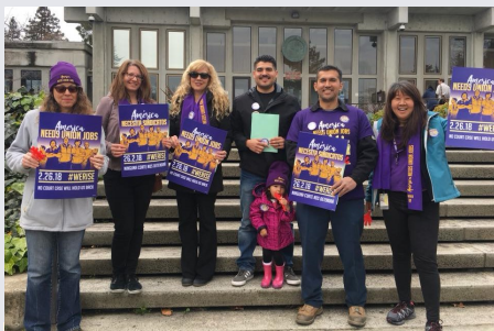
Members from the Santa Cruz Metro participate in a lunchtime rally at the Santa Cruz Courthouse.

SEIU Local 521 members from Bakersfield, Fresno, Redwood City, Salinas, San Jose, and Santa Cruz came together to stand up against Billionaire CEOs and the corporate giants behind the Janus v. AFSCME case—to learn more about what is at stake, visit www.seiu521.org/rtw