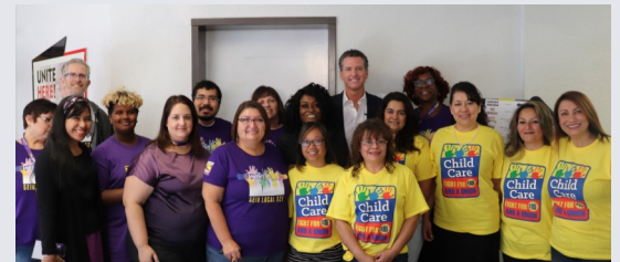
SEIU members met with Lt. Governor Gavin Newsom at our convention in Oct. 2017, where the candidate for Governor pledged to honor the right of Child Care providers to unionize.