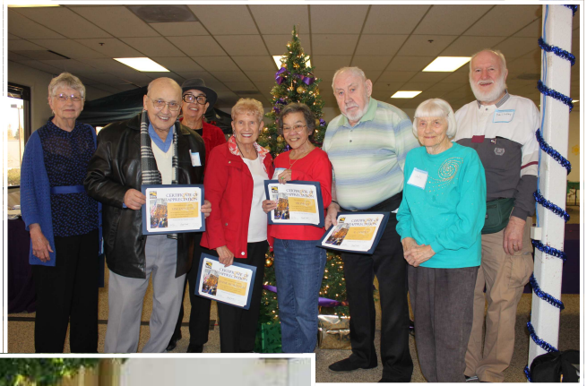
SEIU Local 521 Retired Chapter Annual Holiday Luncheon—Lifetime Members being recognized.