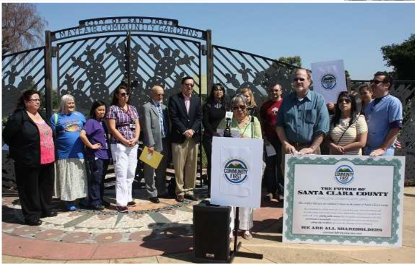
Santa Clara County – Community First Campaign