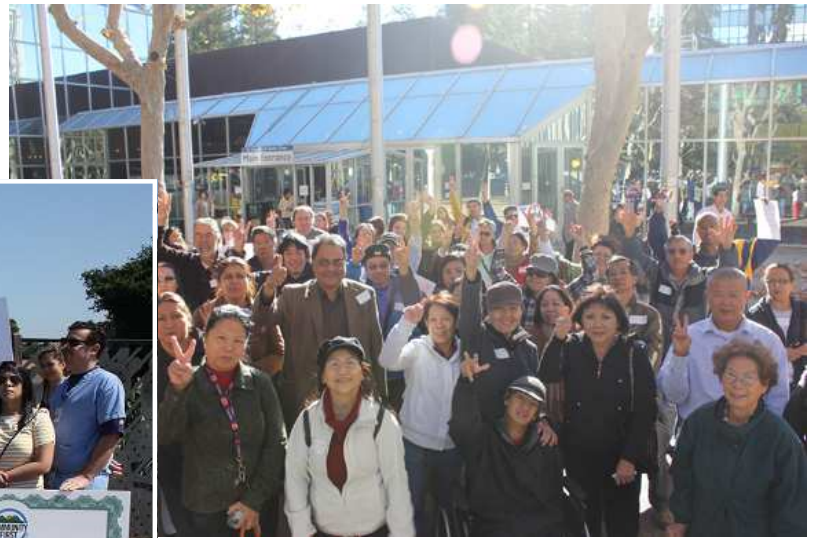
Santa Clara County IHSS Workers Action at County Government Center