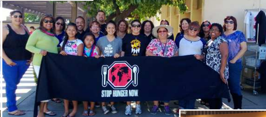
Latino Caucus and Women's Caucus in Fresno joined community organizations, packaging 10,000 dehydrated meals to use in crisis situations around the world.