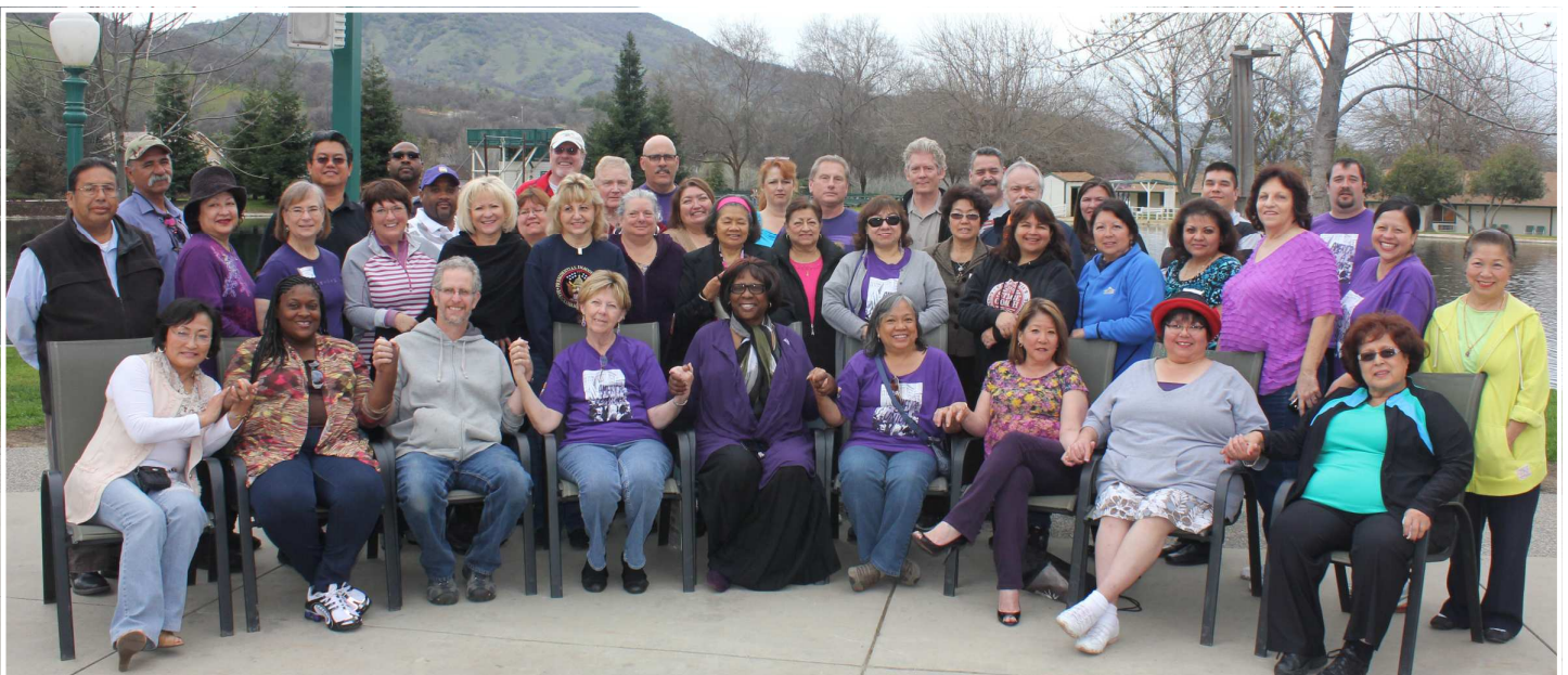
2013 Executive Board Retreat in Wonder Valley