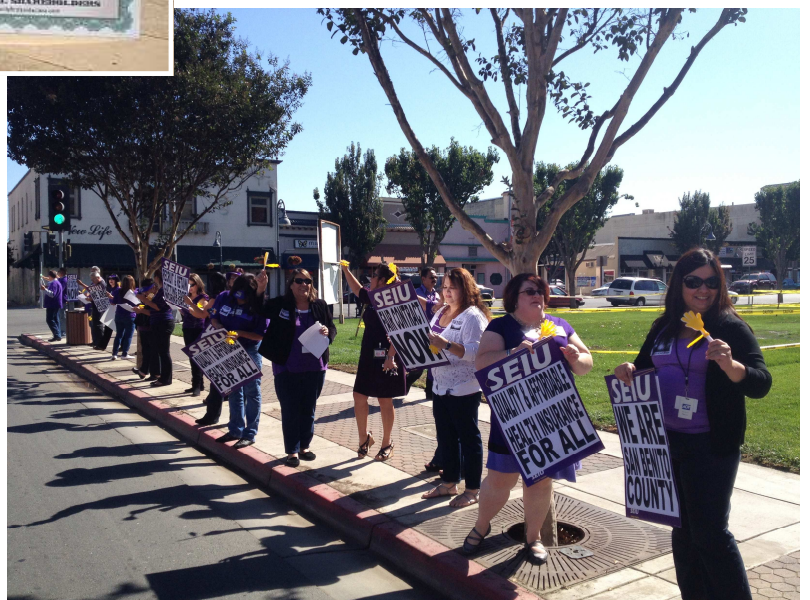
San Benito County Workers