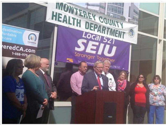
State Sen. Bill Monning kicked off the Covered California health fair in Monterey County on Oct. 2.