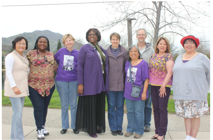
Executive Board Officers (Term 2013-2016) at Executive Board Retreat in Wonder Valley