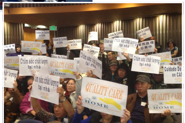
Santa Clara County In-Home Supportive Services Workers at Board of Supervisors Meeting