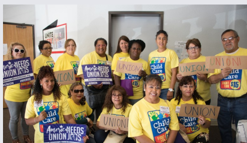
Family child care providers and SEIU 521 members posted their #Union challenge photos online during the town hall.